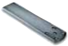
PLA6 rear racket 250mm long Pc/pack 1