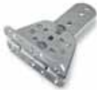
PLA14 screw-adjustable rear bracket Pc/pack 2