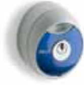
MOSE 1 key selector switch for outdoor installation