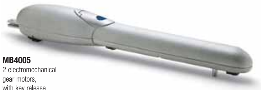
MB4005 2 electromechanical gear motors, with key release

N.B. The content of the package may vary: consult the retailer.