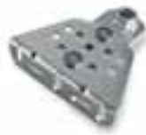
PLA15 screw-adjustable front bracket Pc/pack 2