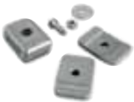
PLA13 travel stops for closing and opening manoeuvres Pc/pack 4