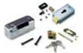
PLA11 horizontal 12V electric lock (required for gates longer than 3m) Pc/pack 1