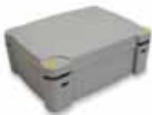
A60 1 control unit A400 with plug-in receiver SMXI