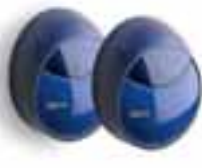
MOF 1 pair of photocells for outdoor installation