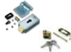
PLA10 vertical 12V electric lock (required for gates longer than 3m) Pc/pack 1